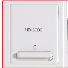
Reverse Stitch Lever