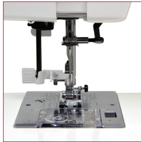
Built-In Needle Threader