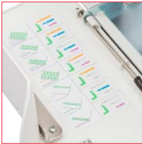
Quick Reference Guide