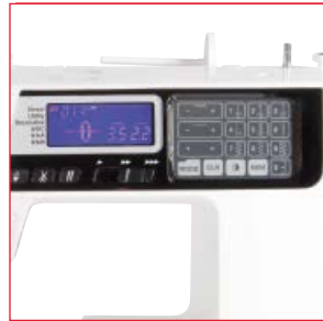
Easy Navigation and LCD Screen