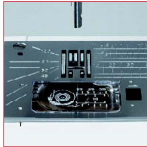
Patented Needle Plate Markings